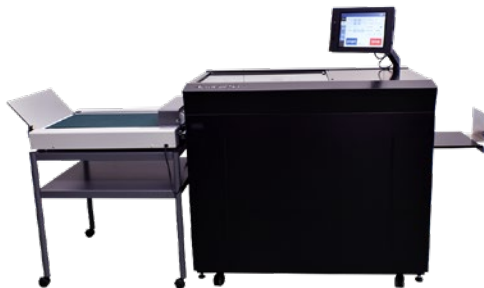
AeroCut X Pro Complete Package

*As part of our continuous product improvement program, specifications are subject to change without notice.